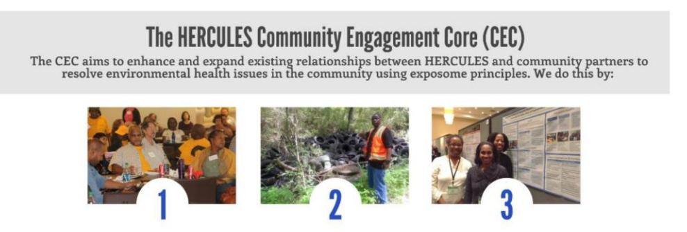
Creating conversations between the Atlanta community and HERCULES

As we near the end of 2018, we wanted to share with you our accomplishments from this past year, and thank you for your support of our efforts!